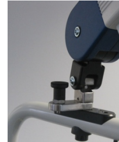
Lockable carry bar